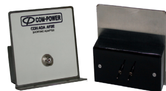
Shorting Adapter Set ADA-AF2E