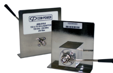
ADA-515-2 Adapter Set