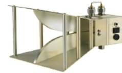
AHA-118 Active Horn Antenna (1-18 GHz)