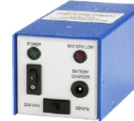
CGC-255E Conducted Comb Generator