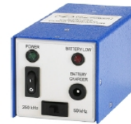
CGC-255E Conducted Comb Generator