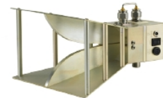
AHA-118 Active Horn Antenna (1-18 GHz)