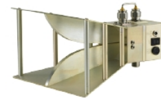
AHA-118 Active Horn Antenna (1-18 GHz)