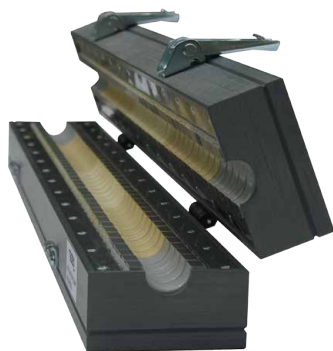
KEMA 801A, side view

The KEMA 801A is recommended as an additional decoupling network (ferrite tube clamp) for immunity test according to IEC / EN 61000-4-6 when using the clamp injection method. It shall be inserted on all the cables between EUT and AE except the cable under test. The KEMA 801A prevents, that the test signal applied to the EUT affects other devices, equipment or systems, which are not under test and improves the reproducibility of the test results.